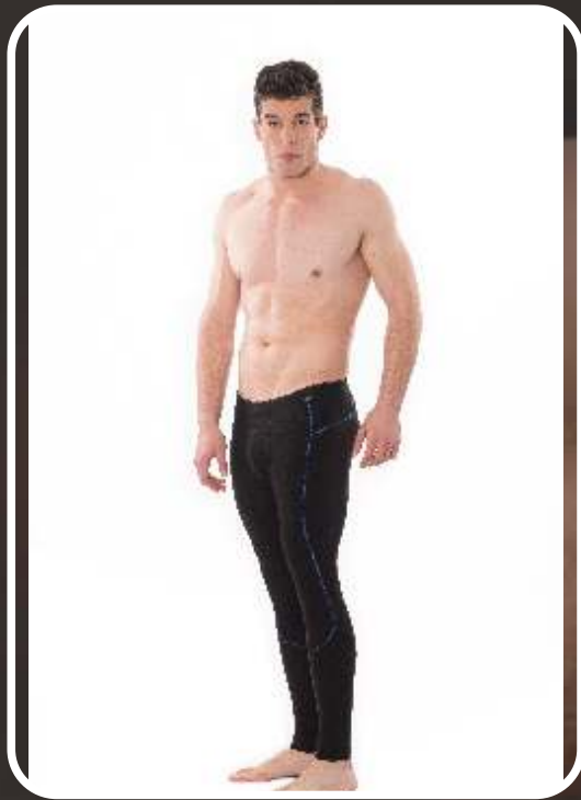
032-4920 Men`s underpants 1/1 trouser

Fabric type: plush Fabric weight: 170 g/m 2 Fabric composition: 50% wool 50% polypropylene