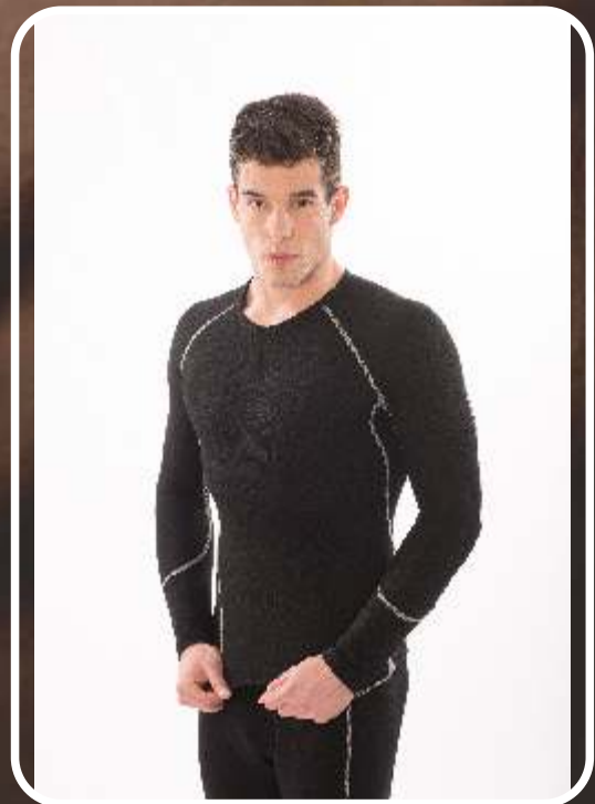
032-3786 Unisex undershirt 1/1 sleeve

Fabric type: plush Fabric weight: 170 g/m 2 Fabric composition: 50% wool 50% polypropylene