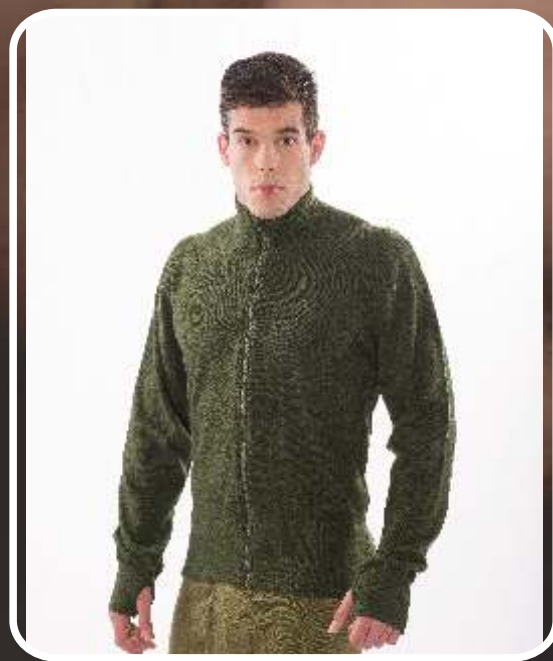
335-3790 Men`s sweater 1/1 sleeve with zipper

Fabric type: plush Fabric weight: 600 g/m 2 Fabric composition: 80% wool 20% PA