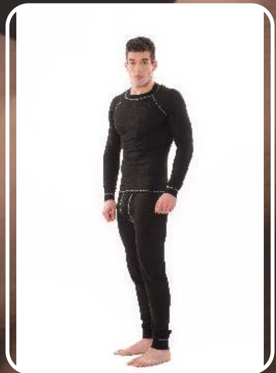
032-3766 Men`s undershirt 1/1 sleeve