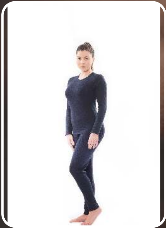
346-7915 Women`s undershirt 1/1 sleeve

Fabric type: plush Fabric weight: 230 g/m 2 Fabric composition: 60% cotton 40% polypropylene