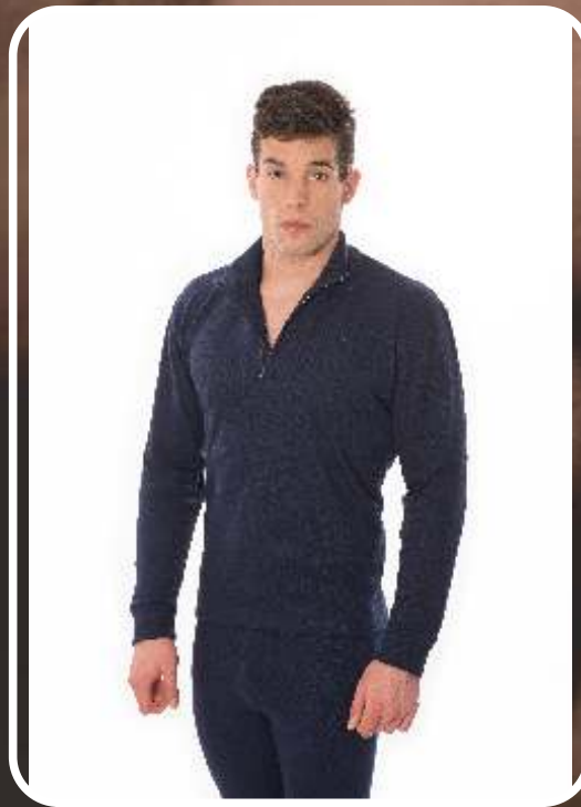
345-3805 Men`s sweater 1/1 sleeve with zipper

Fabric type: plush Fabric weight: 280 g/m 2 Fabric composition: 56% cotton 44% polypropylene