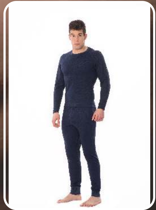
346-3806 Men`s undershirt 1/1 sleeve