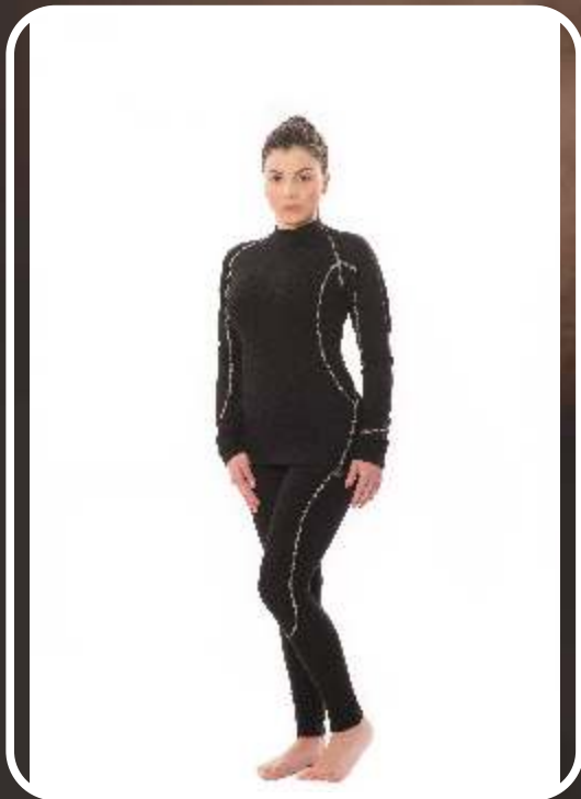
032-3786 Unisex undershirt 1/1 sleeve

Fabric type: plush Fabric weight: 170 g/m 2 Fabric composition: 50% wool 50% polypropylene